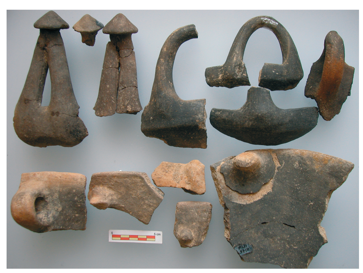
Figure 51.7. Chalcolithic pot sherds, level III.