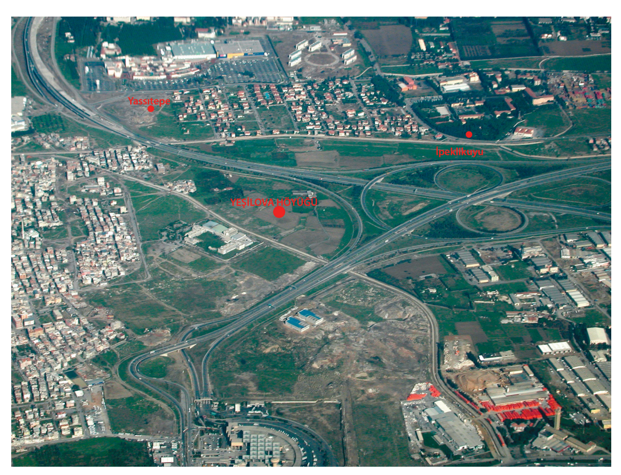
Figure 51.2. View of the Bornova Plain showing location of Yeşilova.

The ratio of open bowls is around 10% among the pottery of level III at Yeşilova. They vary in height, and their sides can be either convex or straight. Various types of handles and lugs are seen on them. On the interior of one group of bowls are symmetrical knob-shaped lugs. Analogues of such bowls are encountered at Liman Tepe VII and Orman Fidanlığı VII.<sup>10</sup>