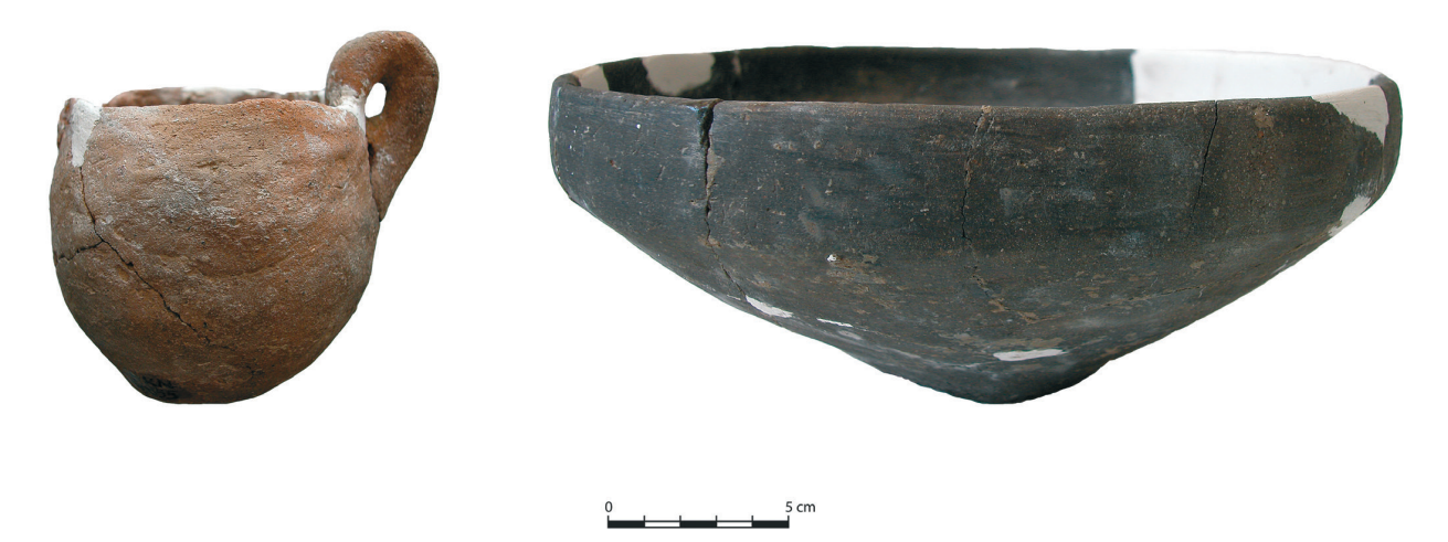
Figure 51.5. Complete Chalcolithic vessels, level III.