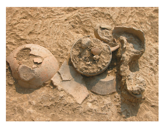
Figure 51.4. Chalcolithic vessels during excavation of level III.

The settlement of level III at Yeşilova reflects an advanced phase of the Middle Chalcolithic period. Gülpınar in North-Western Anatolia seems to belong to an earlier stage. Some parallels of the Yesilova pottery found in the pottery of sites such as Kum Tepe IA form the basis of this inference.<sup>13</sup> Footed bowls are a characteristic example of this. The final phase of the process is observed at the settlement of Liman Tepe VII, where white-painted decoration characterises the ceramic assemblage. This decoration was applied to both carinated bowls with high handles<sup>14</sup> and newly-occurring bowls with inward-thickened rims.<sup>15</sup> There is a group of carinated bowls with high handles in the early layer of the Late Chalcolithic settlement at Bakla Tepe 4.16 It is seen that this typical shape of the Middle Chalcolithic period disappeared, then bowls with inward-thickened rims, some of which had white-painted decoration, and their derivatives,