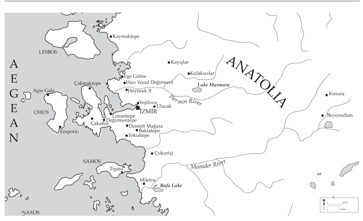
Figure 51.1. Map locating Yeşilova in Central-Western Anatolia.

various sizes, pieces of burned mud and pots belonging to the second level of the Chalcolithic period. Some whole pots and other finds were found in situ on top of this floor (Fig. 51.4).