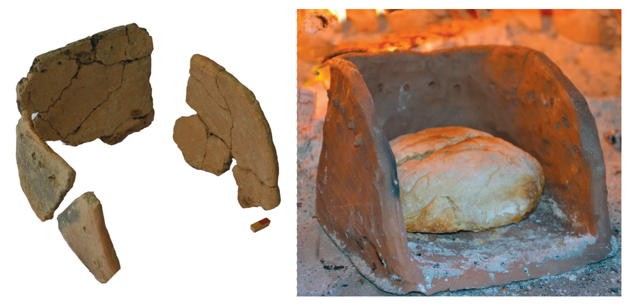
Figure 51.8. Fragments of a cheese pot (?) and suggested use in baking bread.