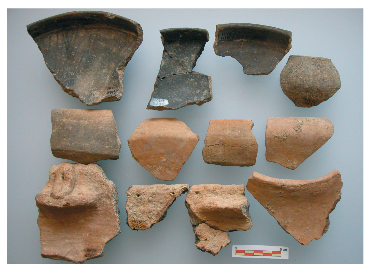
Figure 51.6. Chalcolithic pot sherds, level III.